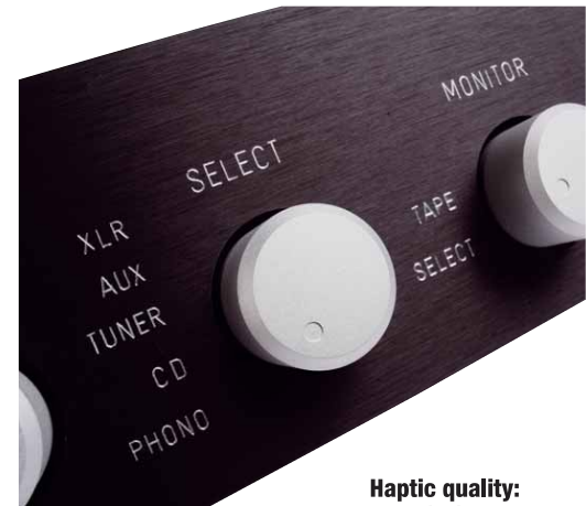
Haptic quality: The large knobs invite you to operate them; they switch with such wonderful precision and feel exactly as they should.