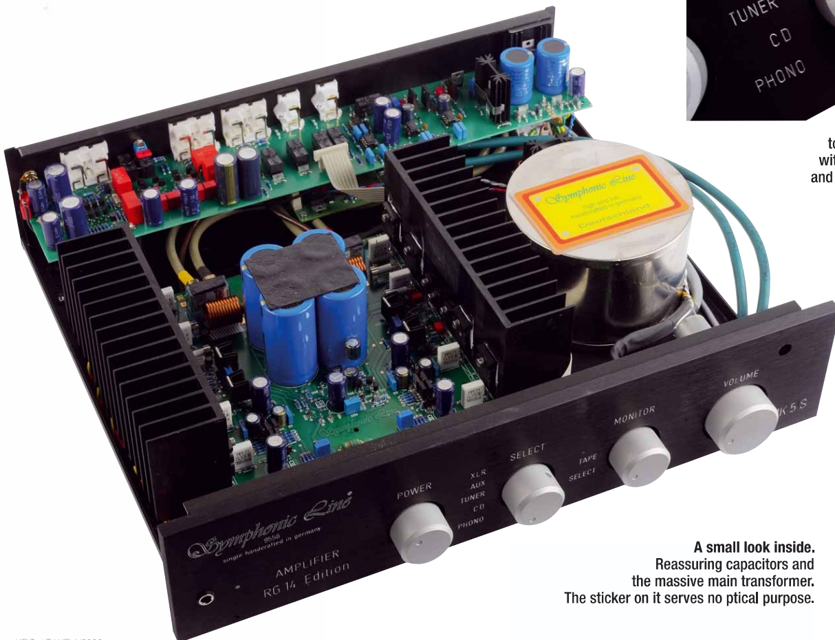
A small look inside. Reassuring capacitors and the massive main transformer. The sticker on it serves no optical purpose.