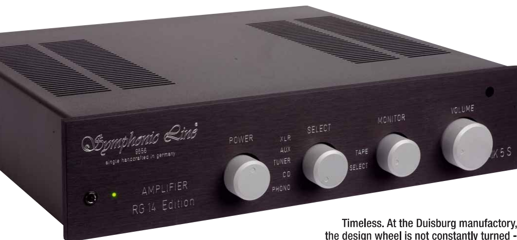
Timeless. At the Duisburg manufactory, the design wheel is not constantly turned - because it has been in harmonious balance for many years.