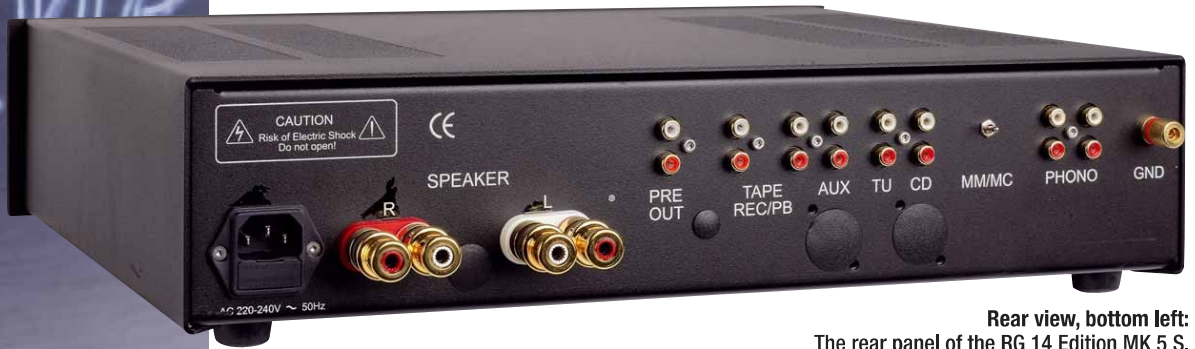
Rear view, bottom left: The rear panel of the RG 14 Edition MK 5 S. Below, there is even free space for XLR